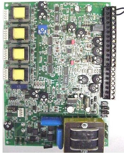
(8) Control board for Regen drives F3R5C and F3R5E PN: 6045-4005