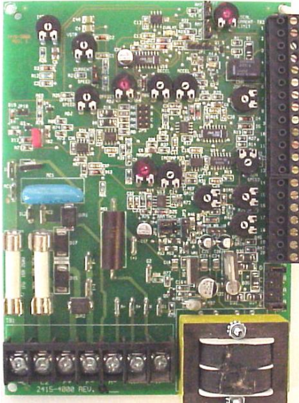
(1) Control Board for Non-Regen drives PN: 2415-4000