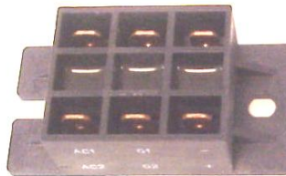
(3) Power Block PN: 3720-004