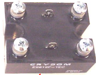
(4) Power Block PN: 3720-010A