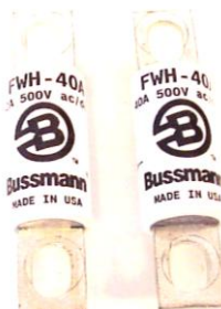
(6) Fuse PN: 3701-504000