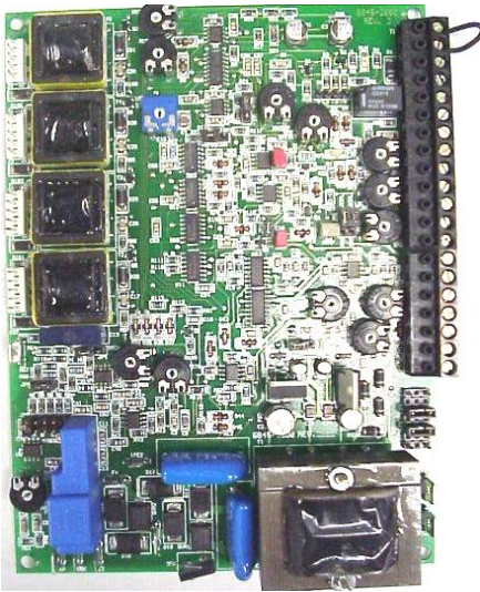
(7) Control board for Regen drives F3R2C and F3R2E PN: 6045-4000