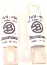
(9) Fuse PN: 3701-506000