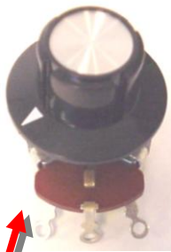
(2) Potentiometer PN: 3533-0502