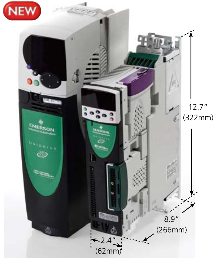
Comparison photograph above and illustration below show the size difference between a Unidrive SP size 1 and the new size Zero.

Safe Torque Off input disables the output stage of the drive with a high degree of security. This reduces the cost of complying with machine safety standards such as EN954 Cat 3 and enables the drive to integrate easily with the machine safety circuit.