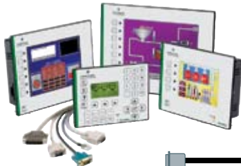
CTVUE-303L, -303M, -306A, -306C, -308A, or -310C