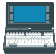
Windows 98, NT 4.0, 2000 XP (32-bit) or Vista (32-bit) Compatible Computer (Customer Supplied)